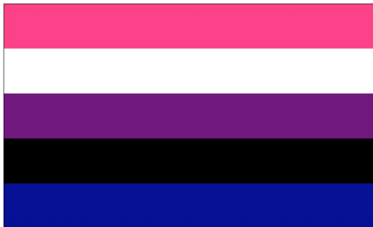
Genderfluid Pride Flag

If you can, include your choir members in your intentions to make your space more inclusive. An attitude of 'calling in' (inviting people to receive information about how to treat others well) tends to work better long term than an attitude of 'calling out' (telling people off for getting things wrong).