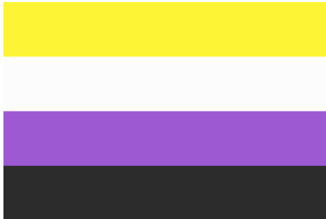
Non Binary Pride Flag

You can find some really helpful and practical resources about pronouns, here .