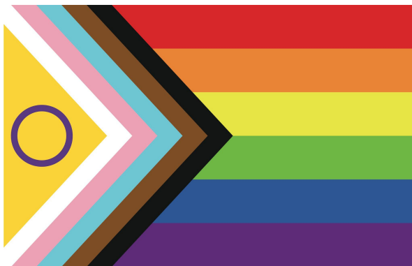
2021 Progress Pride Flag, which incorporates the Intersex Pride Flag