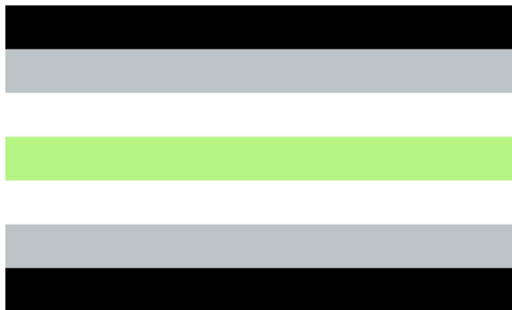
Agender pride flag.

https://genderedintelligence.co.uk/professionals/resources/toilets